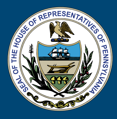
SPRING 2021 RepFiedler.com

District Office 2400 S. 9th St., Philadelphia, PA 19148 P: 215-271-9190 F: 215-952-1025